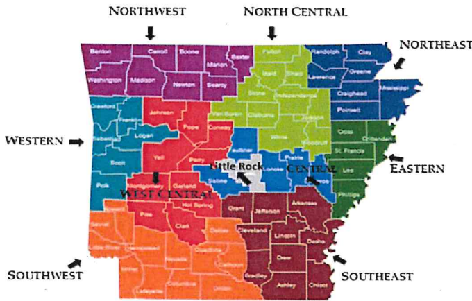
10 Local Workforce Development Areas & Boards