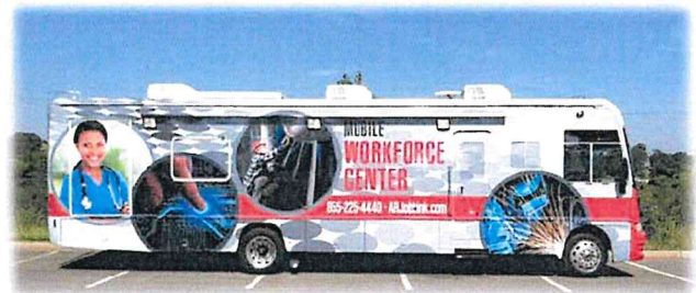
Fully equipped Workforce Center on wheels!